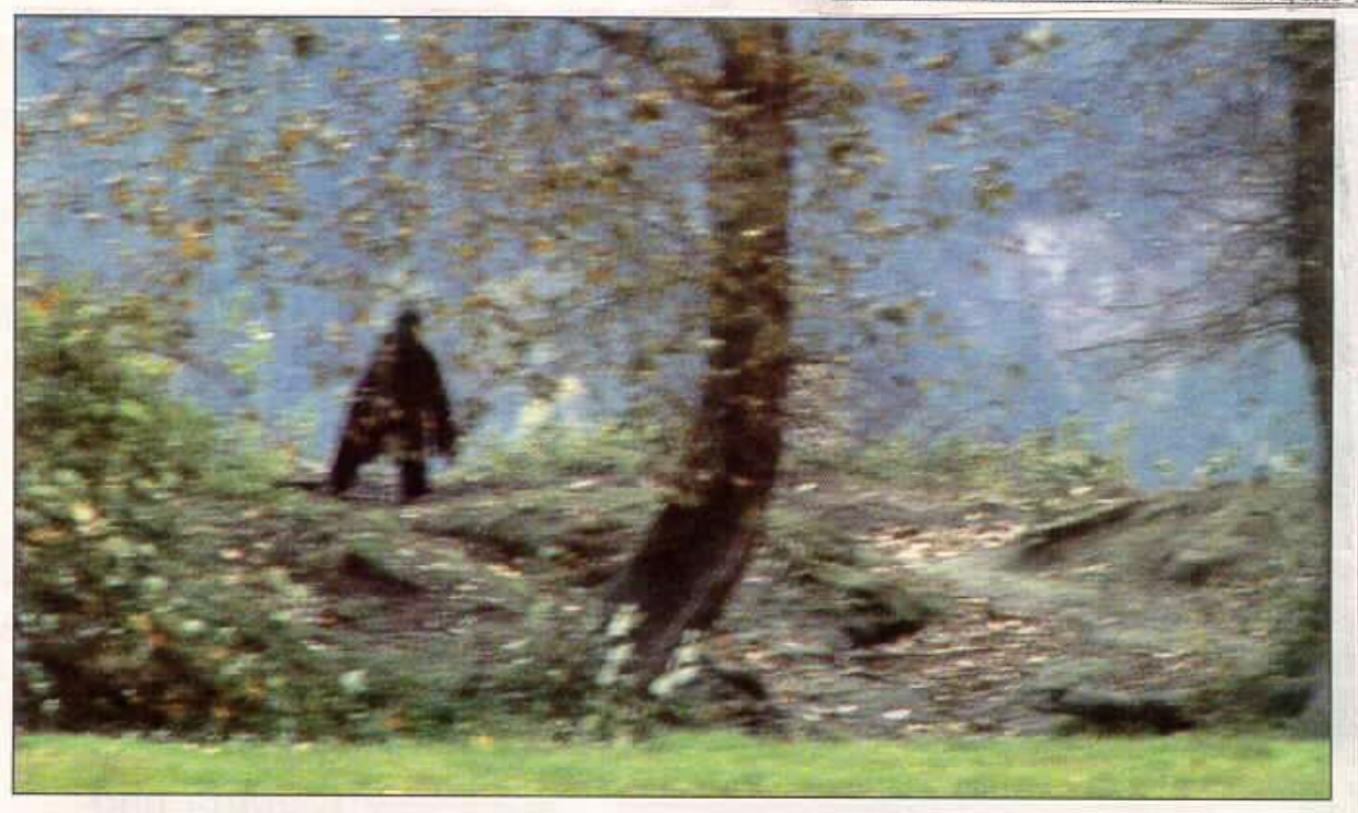
A boat full of people taking Fraser River Safari's tour Sunday spotted this figure on the bank of the river. Could it be the sasquatch?